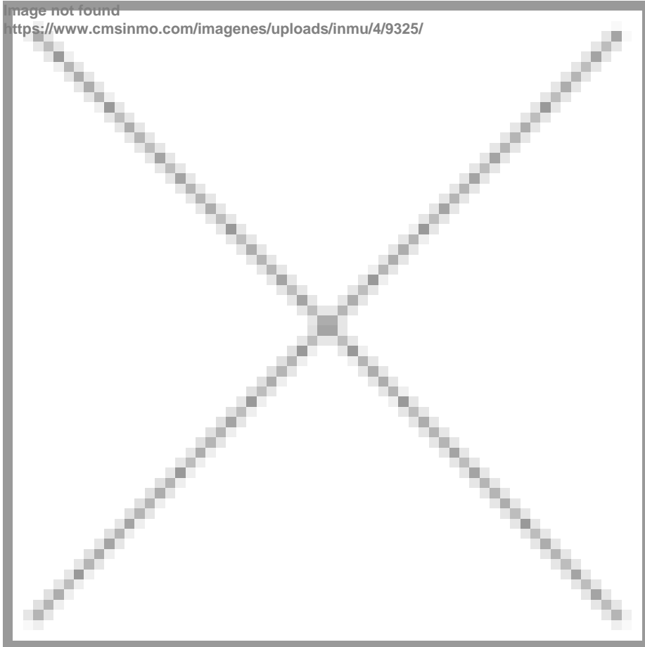
Image not found https://www.cmsinmo.com/imagenes/uploads/inmu/4/9325/