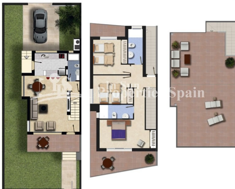
Imagen Artística carece de valor contractual/Artistic Image free of contractual nature